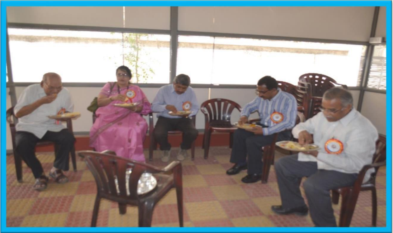
Guests Having lunch on the occasion of "National Science da