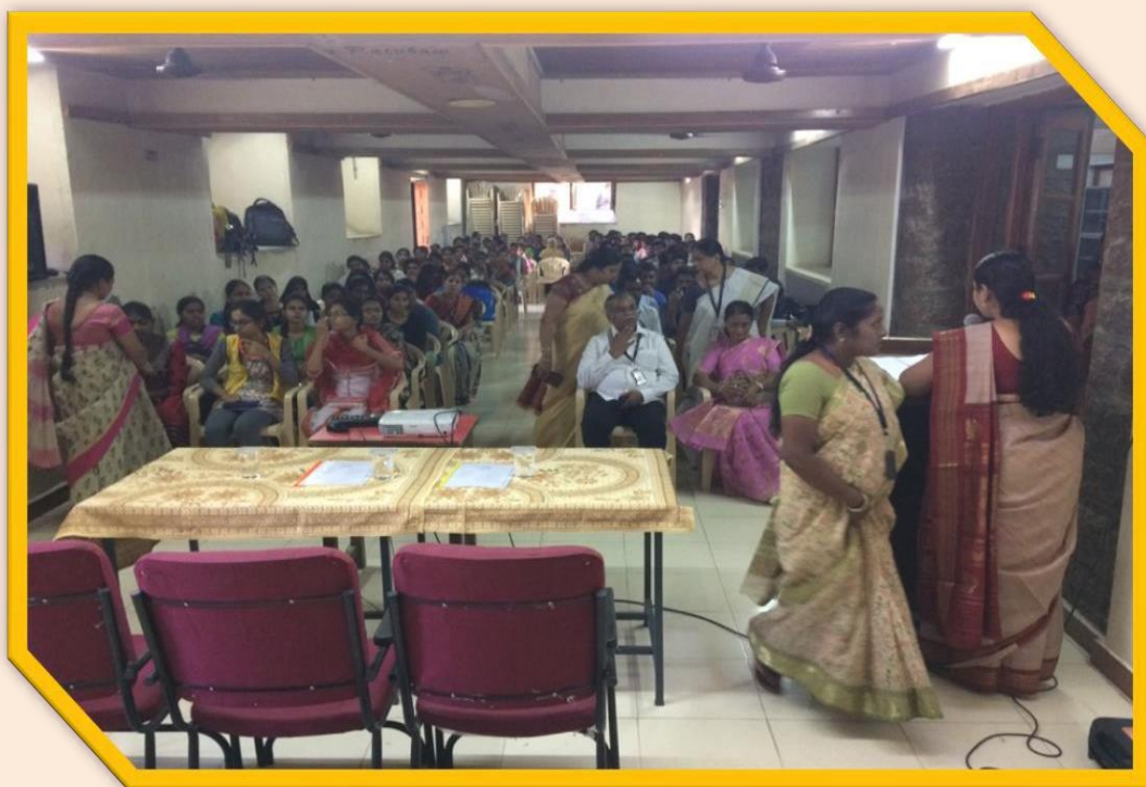
Ever one assembled in the S.V. Hall for the Programme.