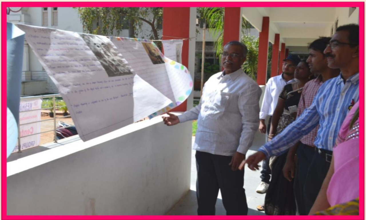
Guests watching the paintings and posters drawn by the students