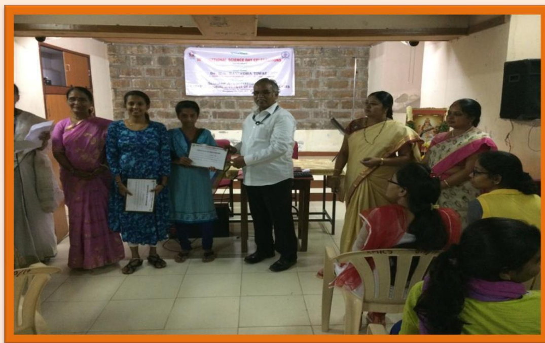
Prize distribution for drawing