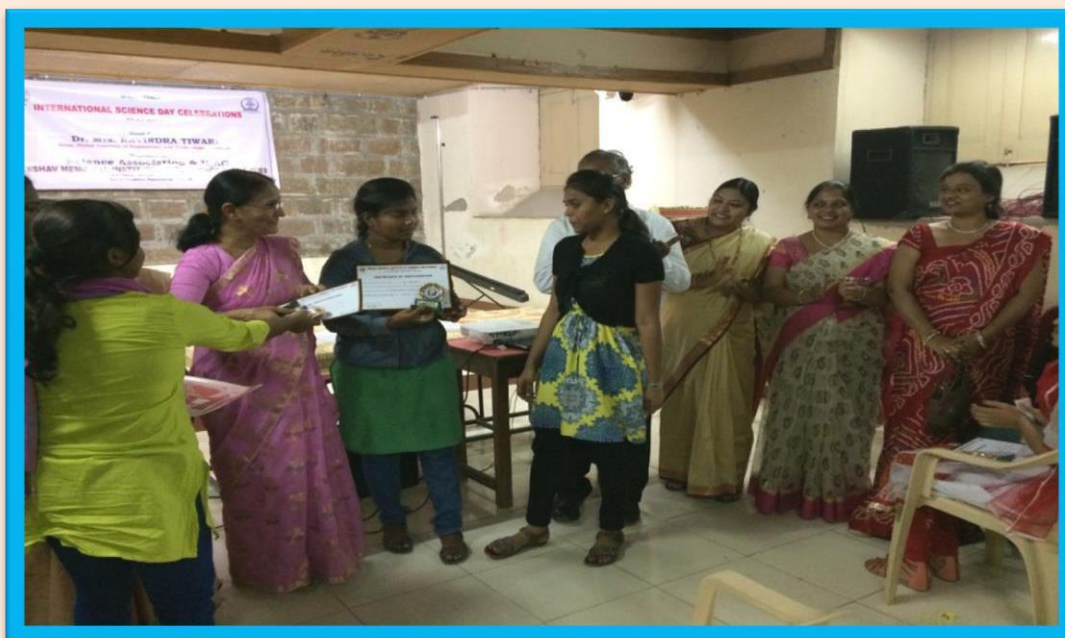
Prize Distribution to the Students