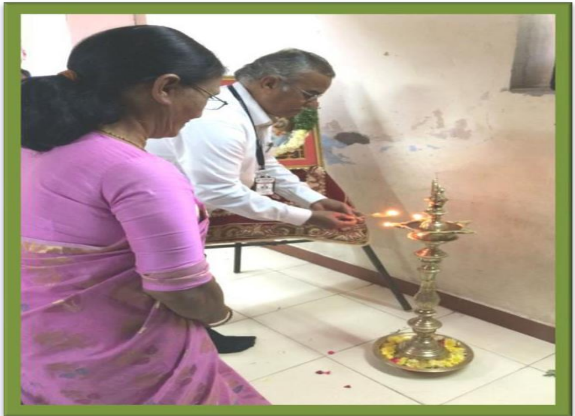
Principal Lighting the Lamp at the Inaugural