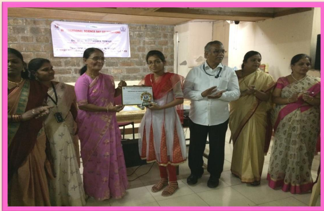
Distribution to the Students for poster presentation