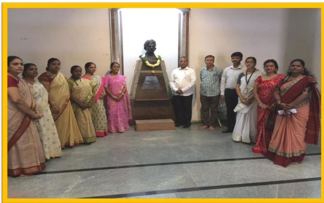
All the members along with Guest speaker, Principal