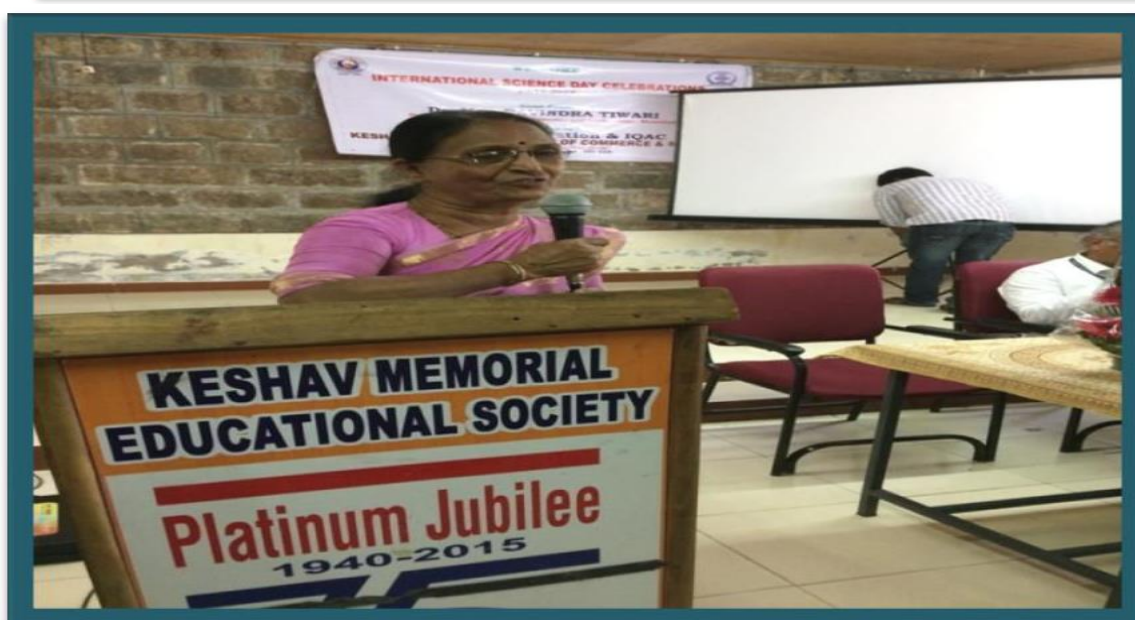
Guest speaker's presentation on International Science Day