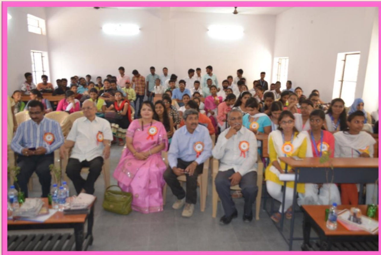
A view of guest with participated students in the event