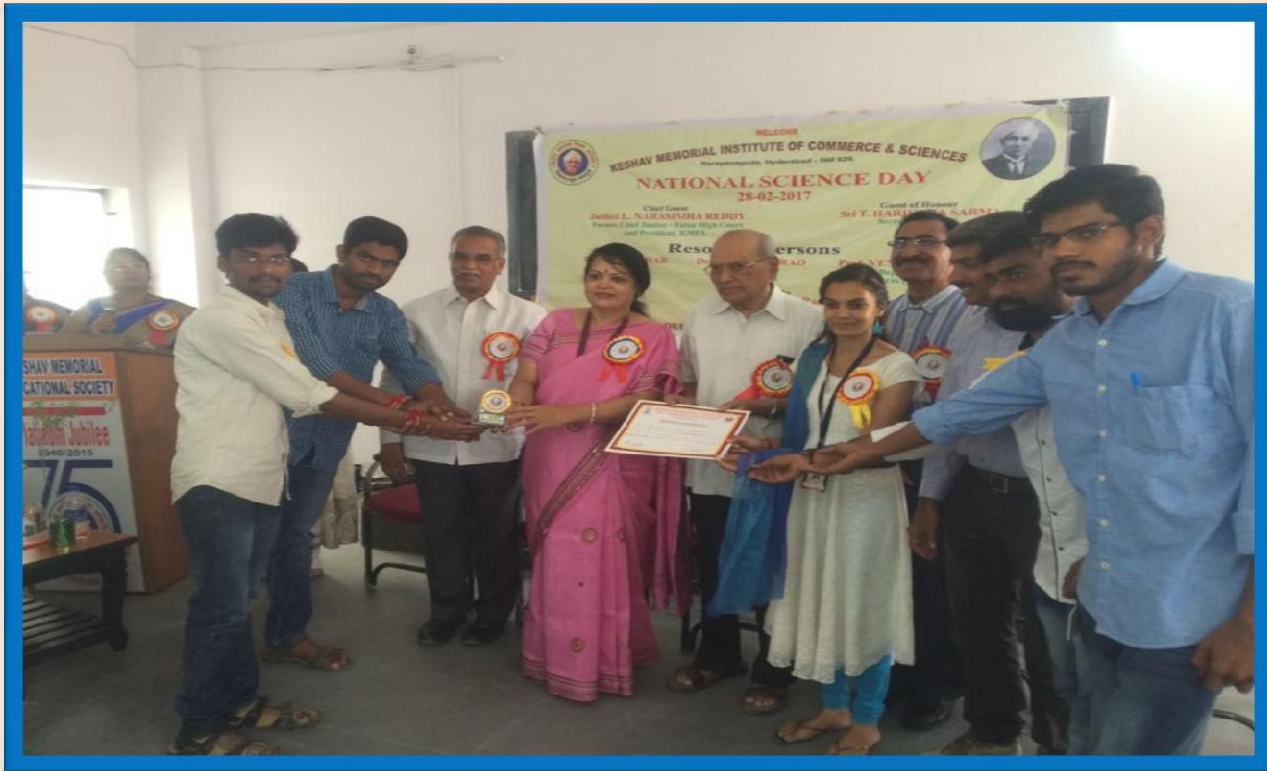
Guest of Honour Presenting the Second prize to winners in Science quiz competition