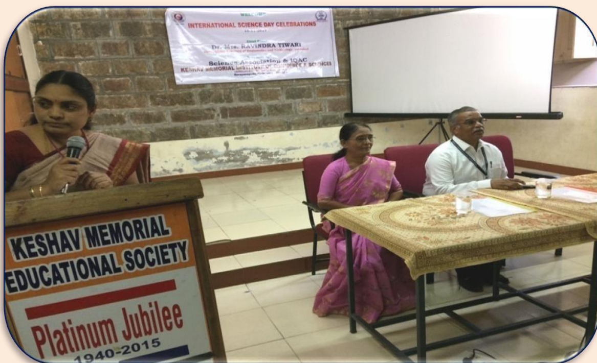
The Guest speaker, principal & IQAC convener were invited on to the Dias