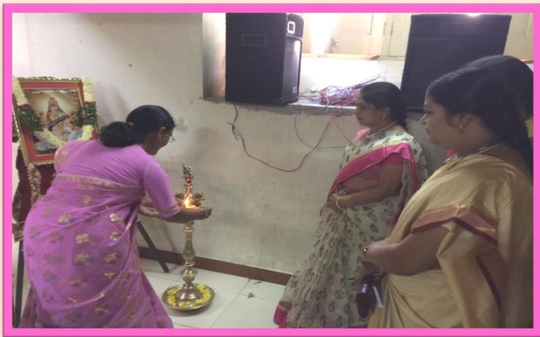
Guest speaker Lighting the Lamp at the Inaugural