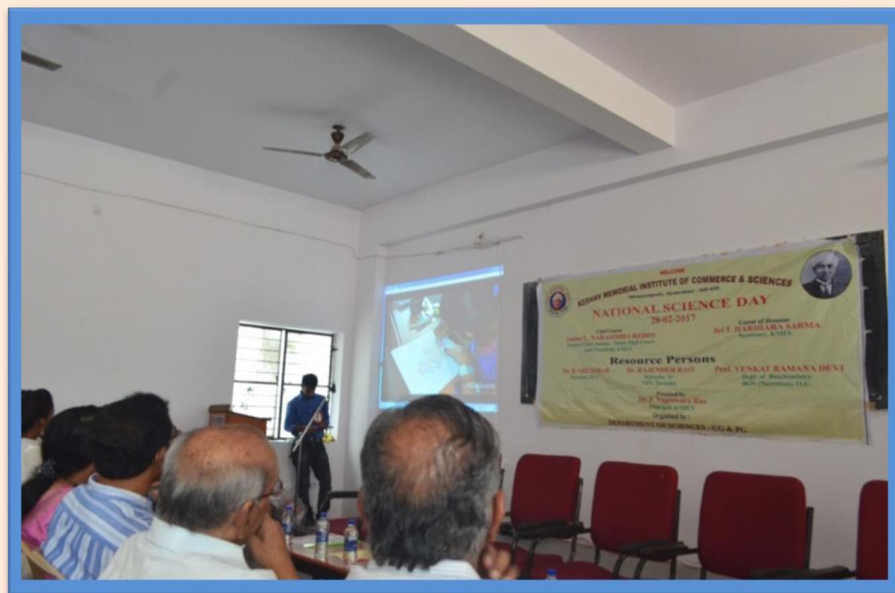
Documentary show about the events conducted