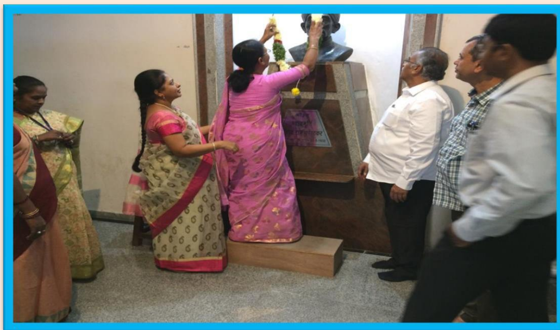
Garlanding the statue

All the science Association committee members received the Guest speaker and offered good hospitality.