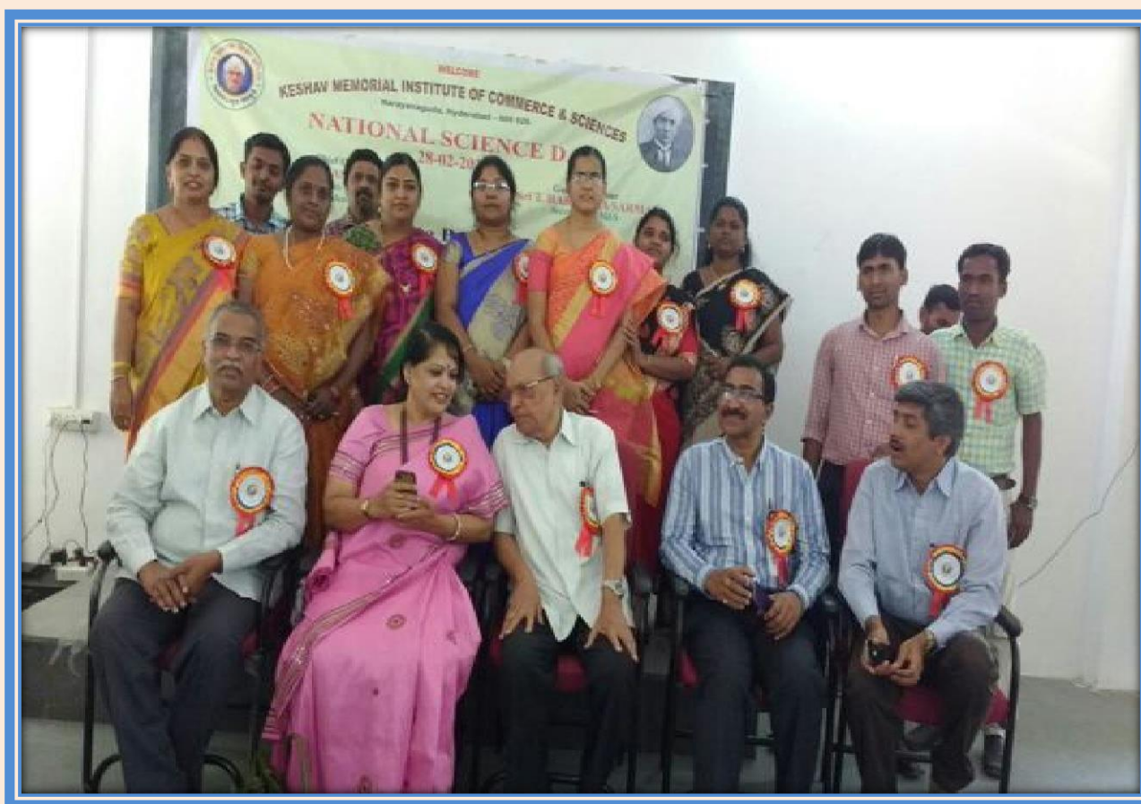
All the Science Association members (UG&PG) with Guests