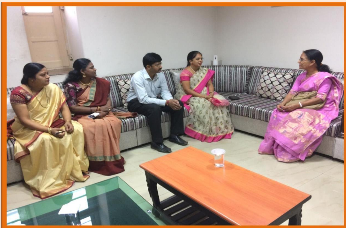
Members interacting with the Guest

All the science Association committee members received the Guest speaker and offered good hospitality.