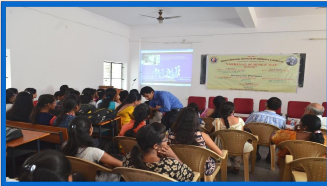
Documentary show on Indian Scientists